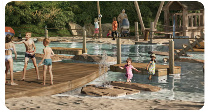
Swimming pools, splash pads and kids' play areas