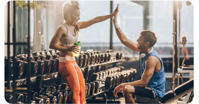
Gyms, outdoor wellness and fitness areas