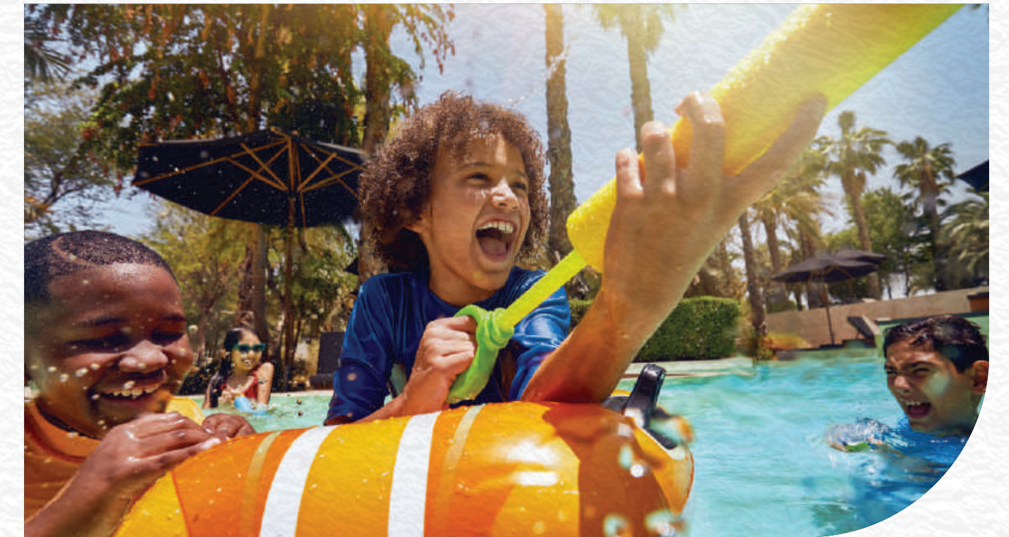
Swimming pools, splash pads and kids' play areas