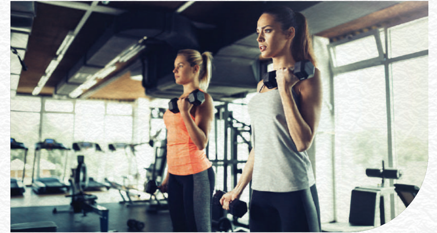
Gyms, outdoor wellness and fitness areas