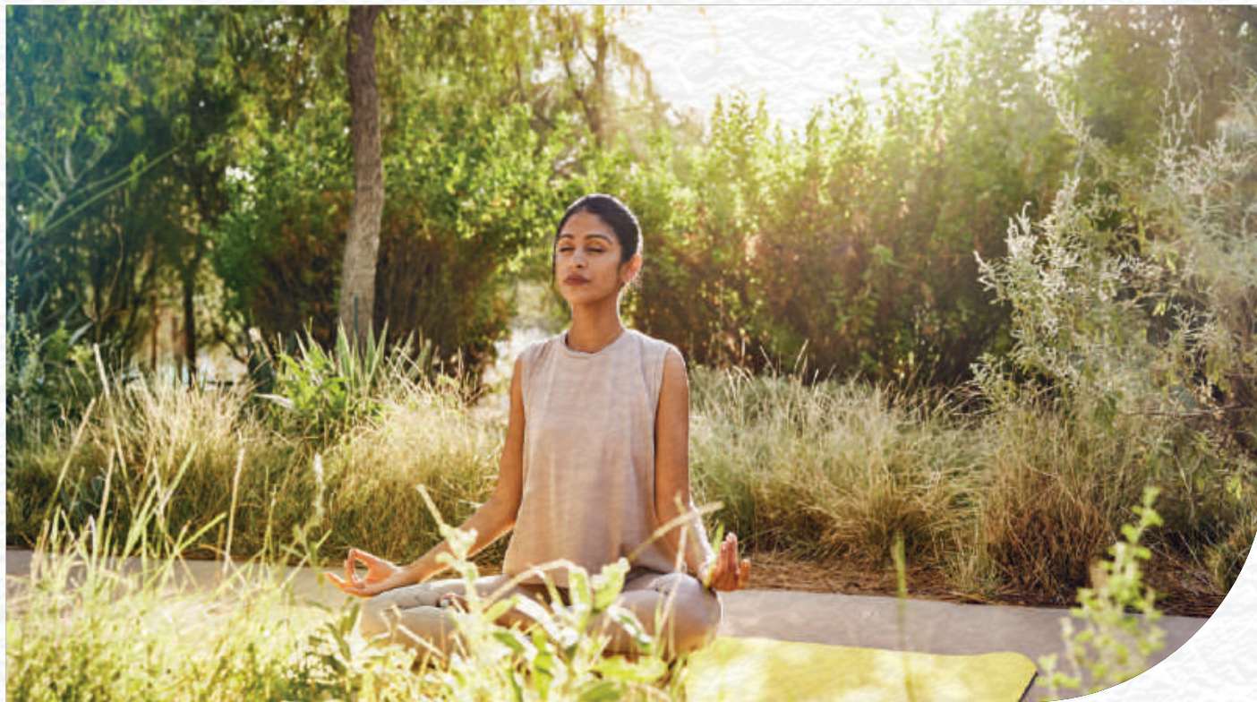
Yoga studio, health & beauty salon, spa and sauna