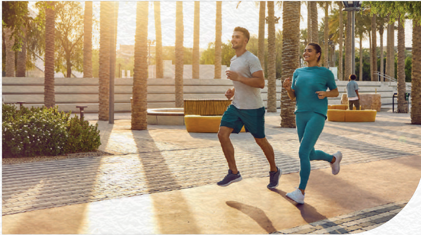
4.5 km of pedestrian tracks and 5.2 km of cycling trails